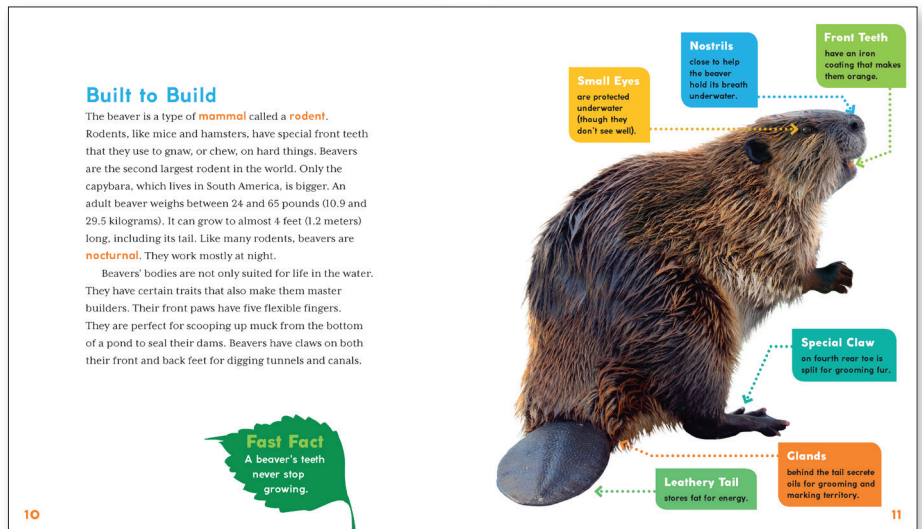
Sample spread from Beavers