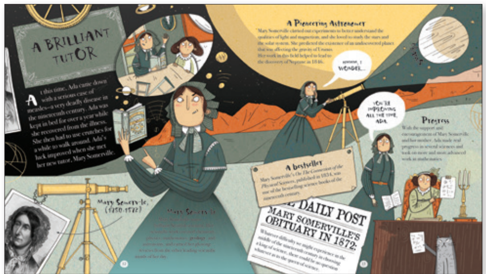
Sample spread from Ada Lovelace

English language rights, North America, (including Canada and Mexico) United States Military Bases, Philippine Islands and Puerto Rico