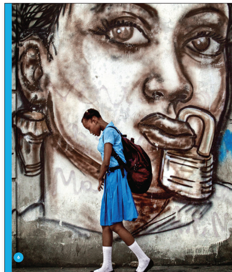
Sample spread from Haiti (previously published title)